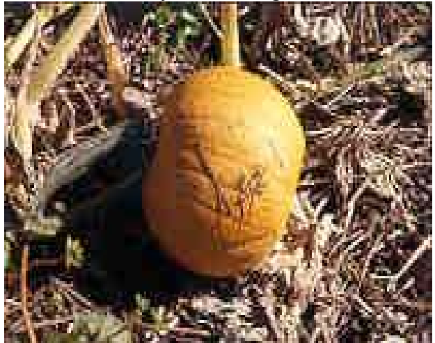
This is the same concept for bare ground fields when soil can stick to the underside of the fruit.

To harvest a clean fruit off of a notill field it is best to pick up the fruit when the field is dry. When the fields are wet cover crop residues can stick to the surface of the fruit and dry on in storage.